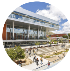
Palomar College LPA Design