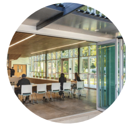
Boys Republic A4E