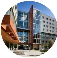
Cal Poly Pomona HMC Architects