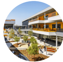
Roosevelt HS LPA Design