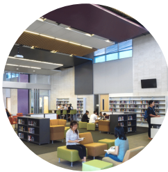
Portola HS HMC Architects