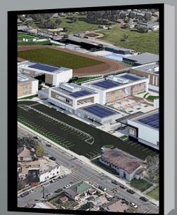
Logan Memorial Education Complex Baker-Nowicki Design Studio