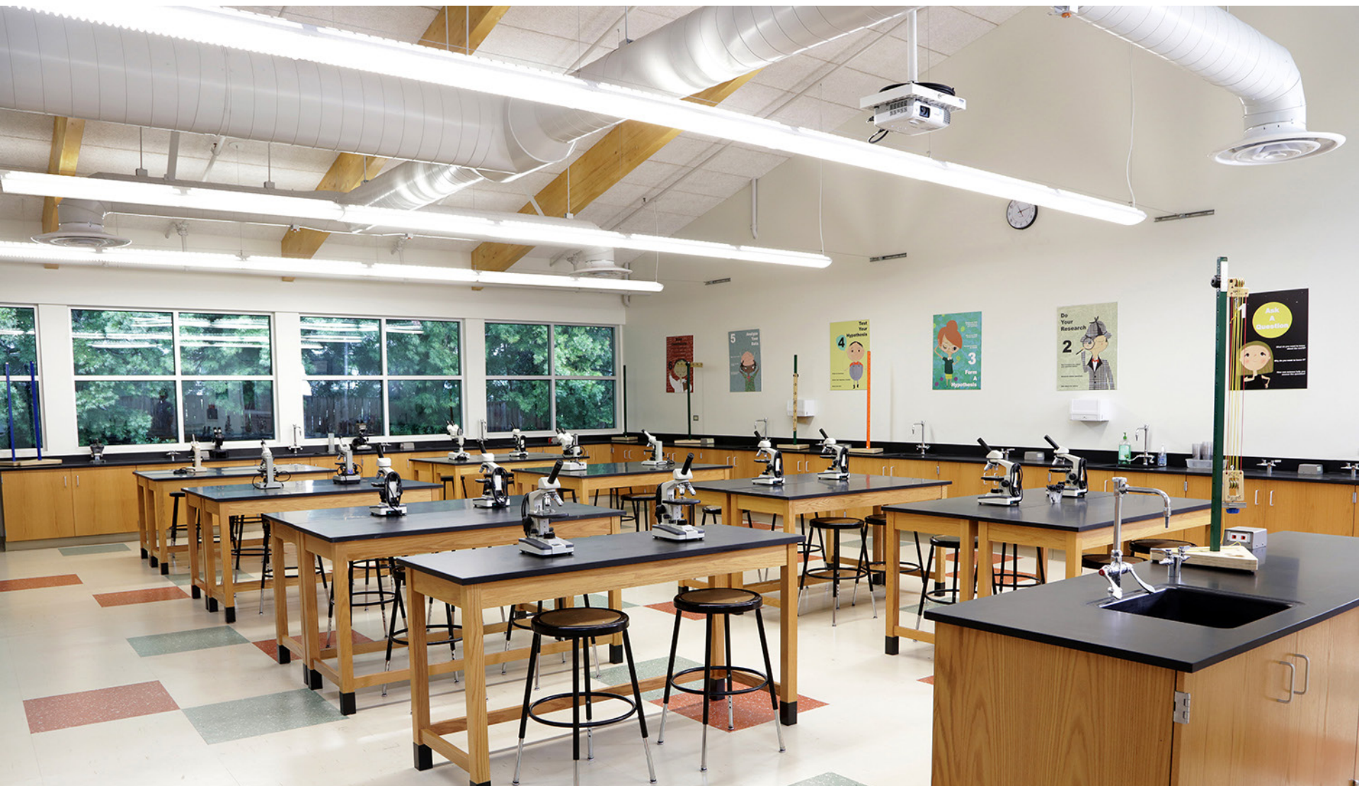
Interior View - Science Classroom

Biophilic principles informed the design of interior spaces, with views to nature, light from clerestory and view windows on multiple walls in each space, use of warm natural materials, and large volumes.