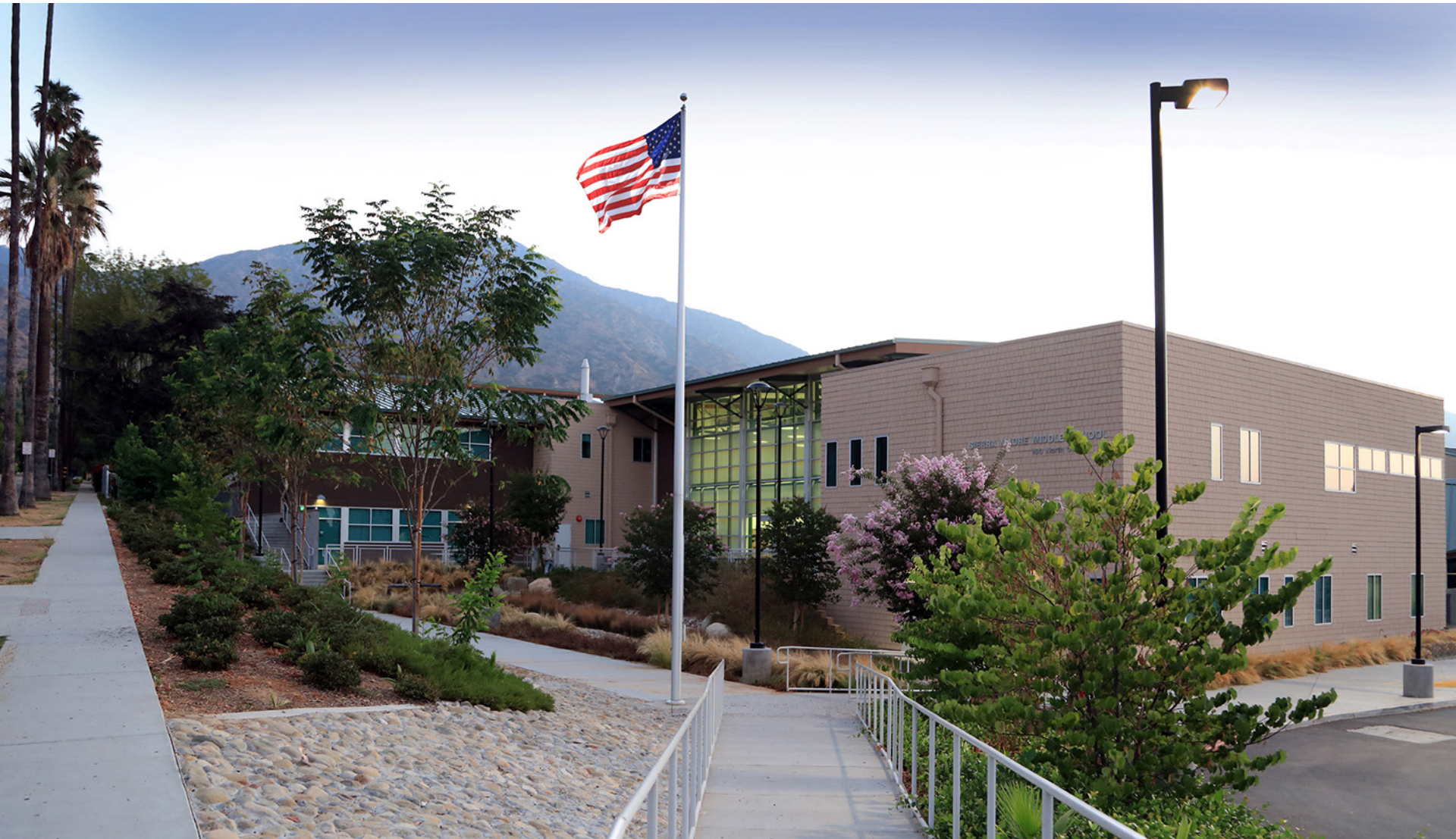
Sierra Madre Middle School New Campus Pasadena Unified School District

Campus entry view from the street of the administration/library/ community building.