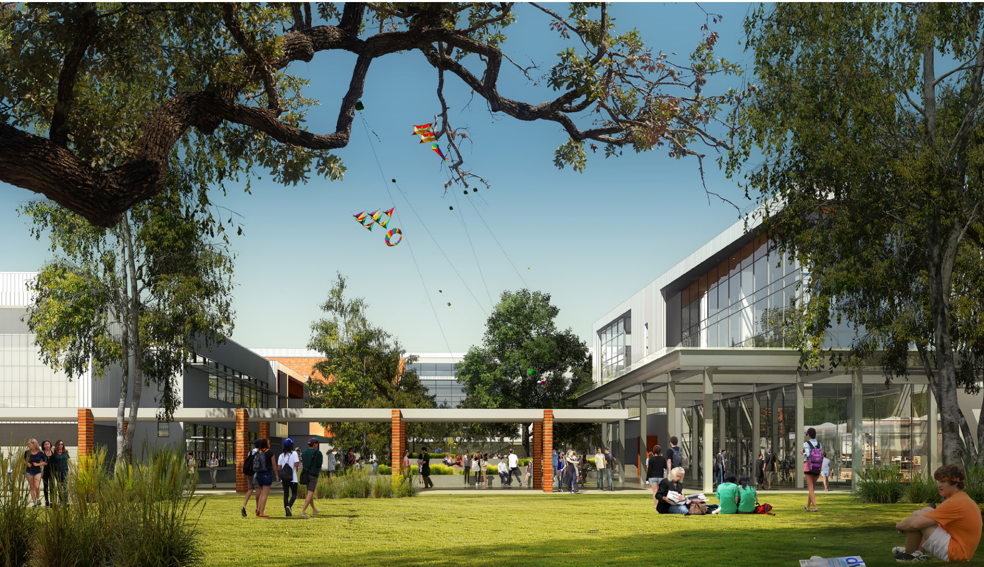
Grover Cleveland Charter High School Comprehensive Modernization Los Angeles Unified School District

View from existing quad into new expanded quad with performing arts center (right), general classroom building (left), and science classroom building (beyond).