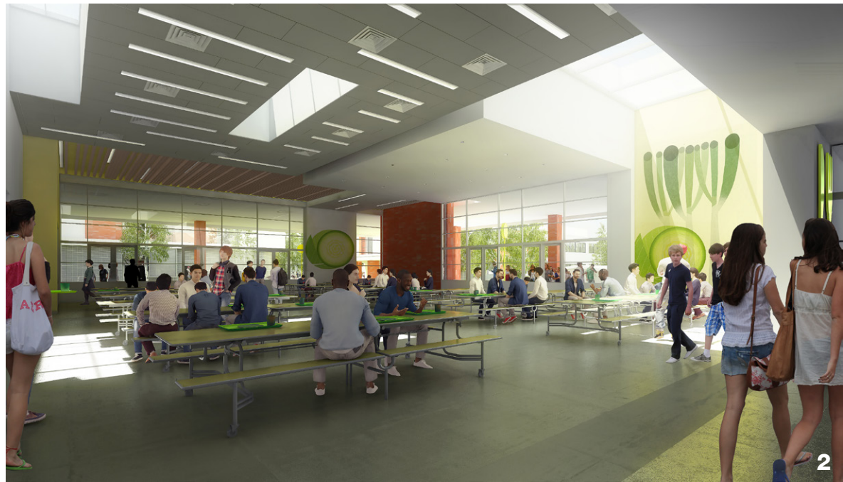
Food Service and Dining Building