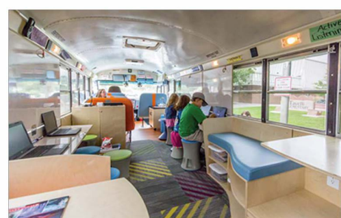
MOBILE ACADEMIC CLASSROOM

Our September membership event will feature the 2018 A4LE award winner Poudre Valley School District's Mobile Academic Classroom by RB+B ARCHITECTS. Stay tuned for more details on date and location.