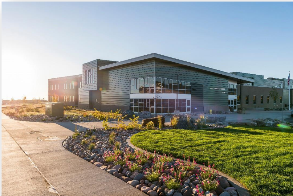
3 Creeks K-8 School Jefferson County Public Schools Hord Coplan Macht

It is a great opportunity to share your best planning experience or design of educational facilities with the rest of the community. We are also requesting submittals on individuals who have committed their career to K-12 school planning and/or design. The award ceremony will take place at the Chapter's Annual Holiday Party. All projects will be prominently displayed as part of an exhibition during the party. All projects will be reviewed prior to the party by a selected Jury representing all sides of school planning, design and construction and evaluated within three categories: new construction, renovation and un-built projects.