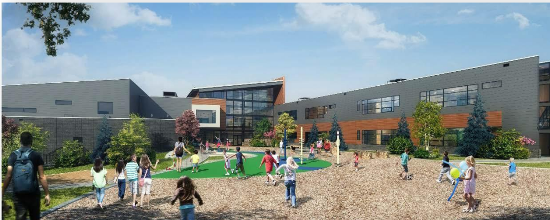
Eagle Valley Elementary School (Unbuilt) Eagle County School District DLR Group (Photo used with permission)