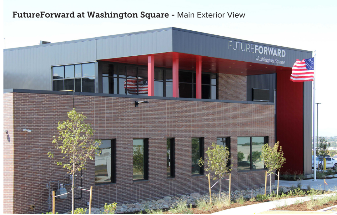
FutureForward at Washington Square - Main Exterior View

The new FutureForward at Washington Square offers both current and new CTE programs. The programs include advanced diesel mechanics, construction trades, welding, Emergency Medical Technician (EMT) training, criminal justice, forensic science, and fire science.