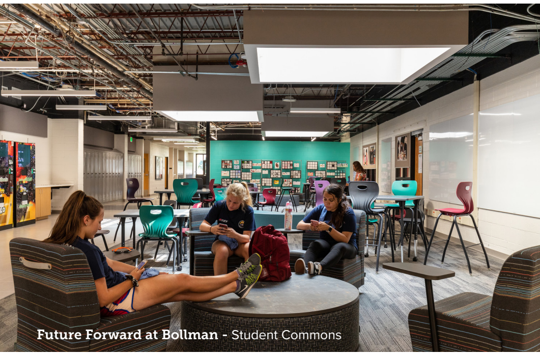
Future Forward at Bollman - Student Commons