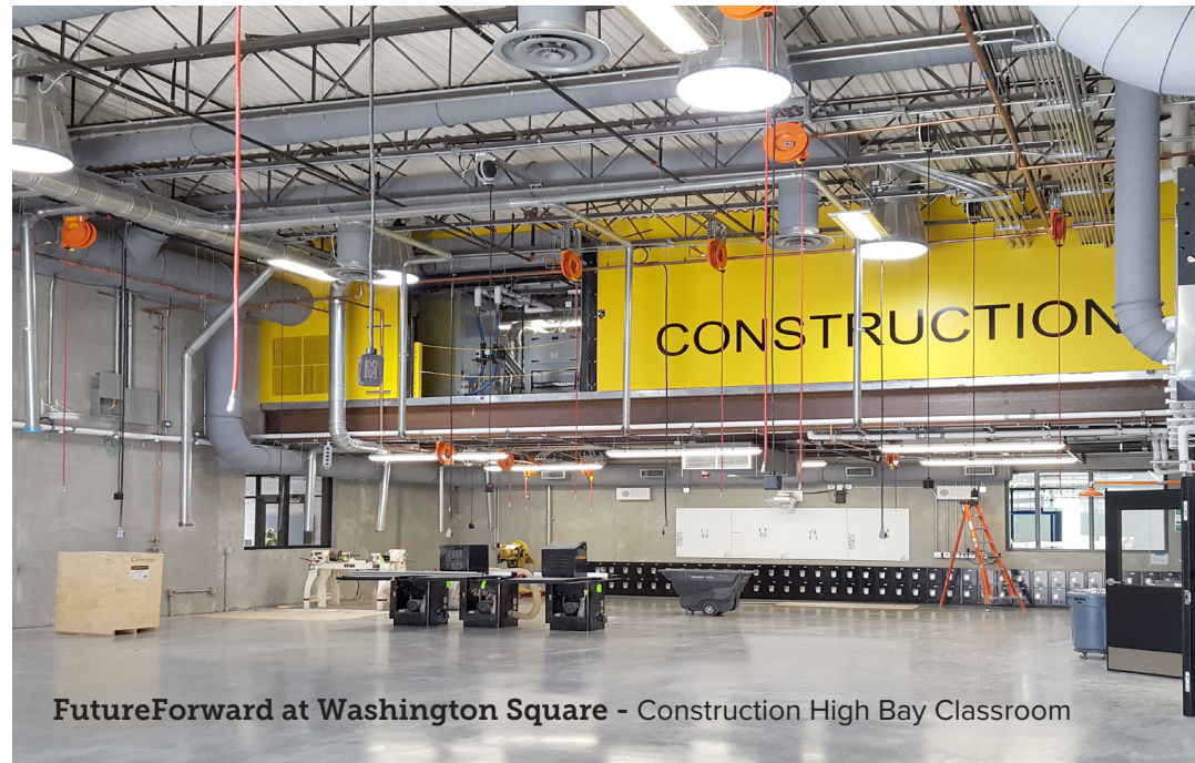
FutureForward at Washington Square - Construction High Bay Classroom