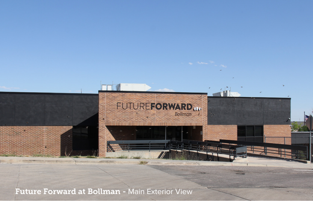
Future Forward at Bollman - Main Exterior View