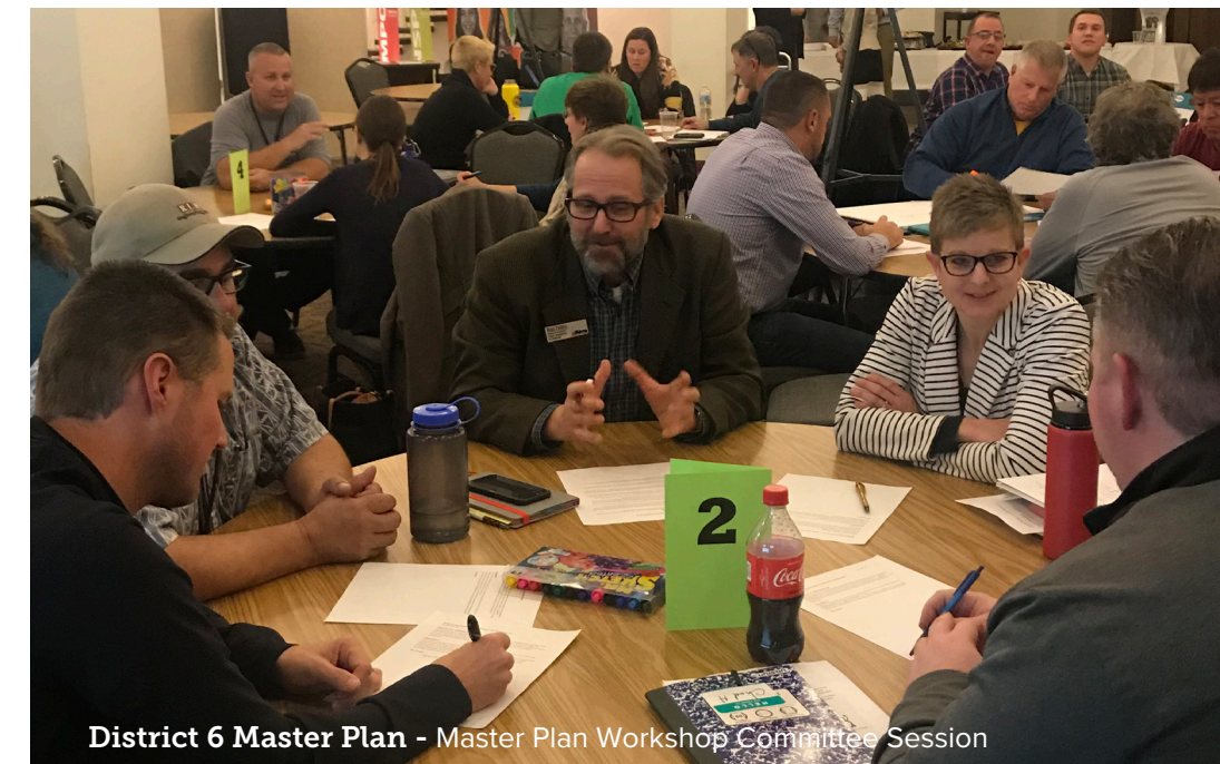
District 6 Master Plan - Master Plan Workshop Committee Session

At the beginning of the Master Plan, the design team collected data and presented it back to the Master Plan Workshop Committee. This information included capacity (existing vs desired), number of portables, and overall square footage per student. We also conducted a Gap Analysis, which surveyed the education adequacy of each building. Additionally, a demographer was hired to look at growth patterns and trends (since District 6 is growing). Through these conversations, it was clear that the Master Plan needed to address four items in the learning environments*: deferred maintenance (fixing what's broken), improvements (educational adequacy and safety/security), capacity (increasing permanent facility sf per student – no portables), and growth (planning for future students).