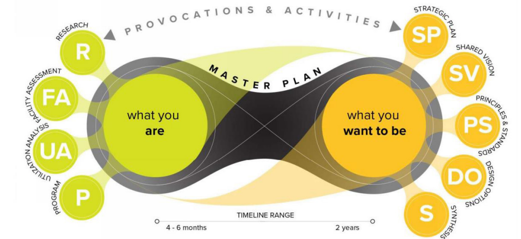
District 6 Master Plan - Process Overview