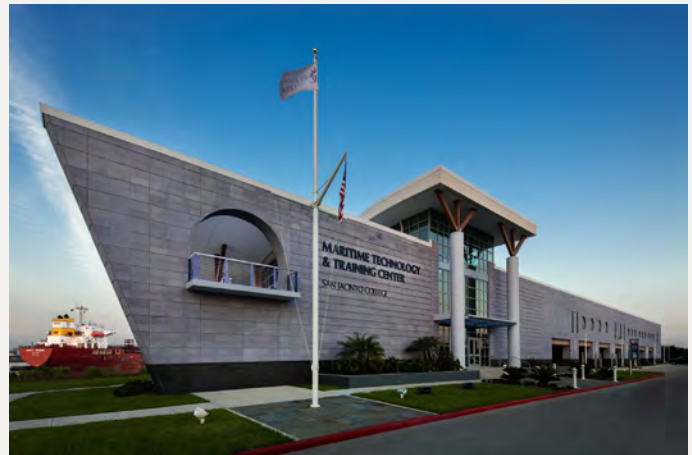
IBI Group / San Jacinto College