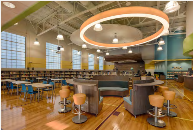
Cr8 Architects / Deer Park ISD

Congratulations are in order for two projects within our chapter that were awarded The Caudill Class Award at the 2017 TASA/TASB Midwinter Conference in Austin, TX. Cr8 Architects / Deer Park ISD won for the Deer Park High School North Campus Project and IBI Group / San Jacinto College won for the Maritime Technology and Training Center. Congratulations to these, and all firms that won awards at the conference.