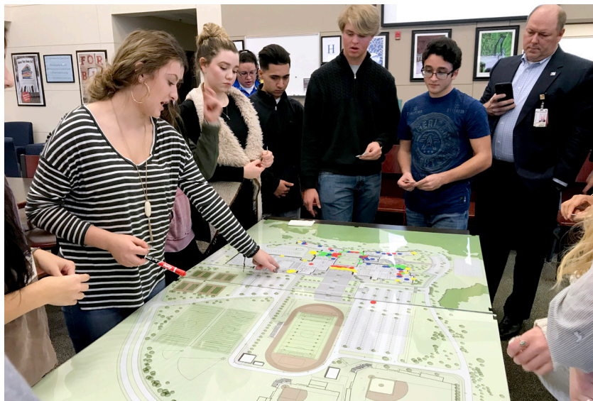
← Students participating in the design charrette process that would inform final programming ↓

— WHAT IT IS 800-student CTE expansion that encourages students to pursue their college and career aspirations.