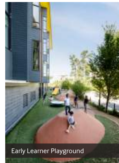
Early Learner Playground