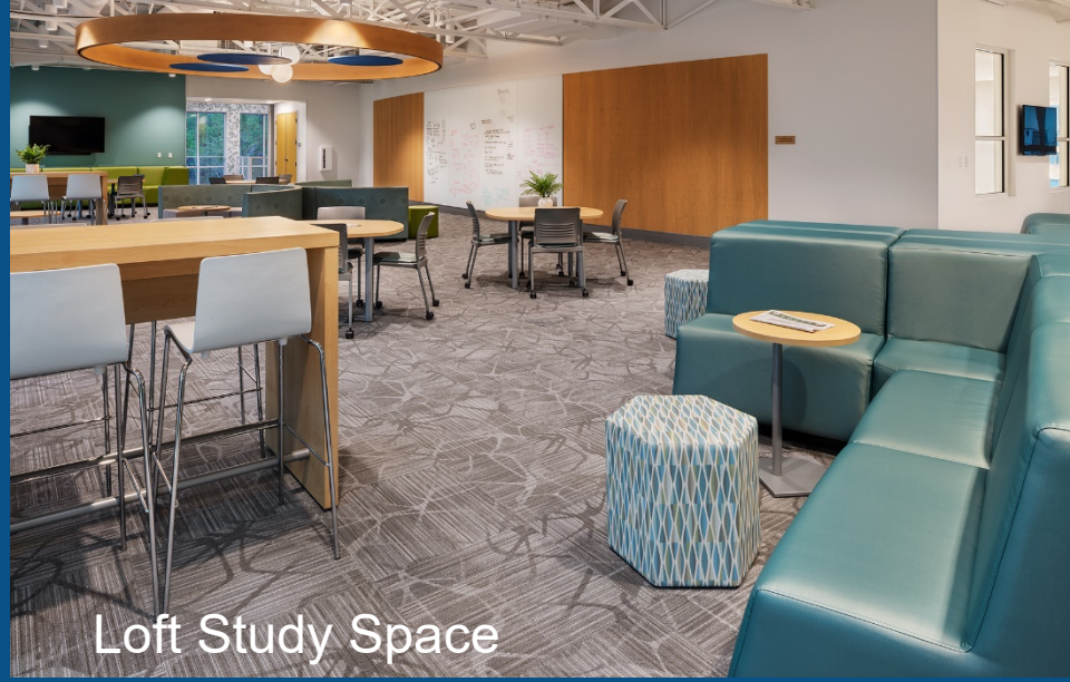
Loft Study Space