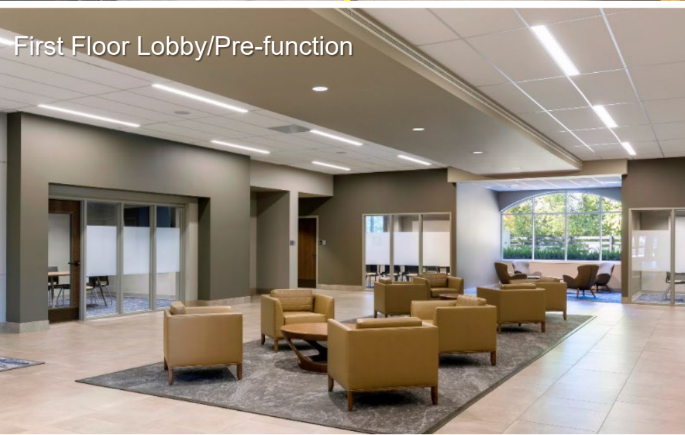
First Floor Lobby/Pre-function