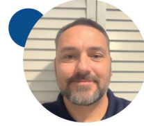
Governor Brett Beckett Lakeshore Learning Materials