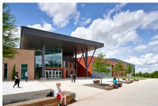
Capps Middle School