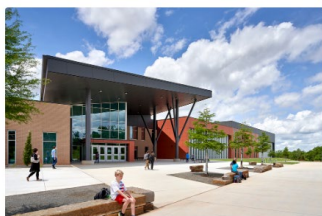
Capps Middle School

City of Boston Public Schools Roxbury, MA