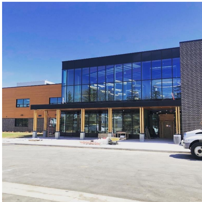
Rosthern School Photo Credit: Troy Smith, Group2 Architecture Interior Design

Unfortunately, our A4LE Saskatchewan Conference 2020 has been cancelled. We will plan to resume with the 2021 conference in January 2021. Details and location to follow as soon as possible. As the new Rosthern K-12 School nears construction completion this will allow it time to open and be filled with furniture, teachers, students, and staff for tours at our conference in January.