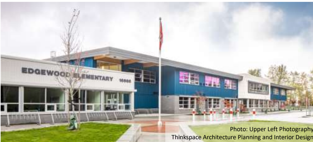
Thinkspace Architecture Planning and Interior Design