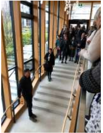
BCIT Health Sciences and Indian Residential School & Dialog Centre tours 2023 PNWR Conference