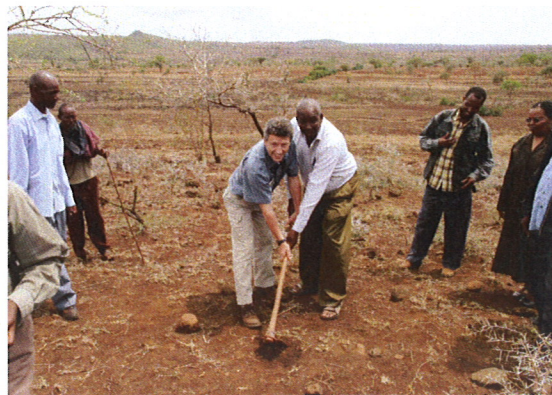
breaking ground for first 2 classrooms