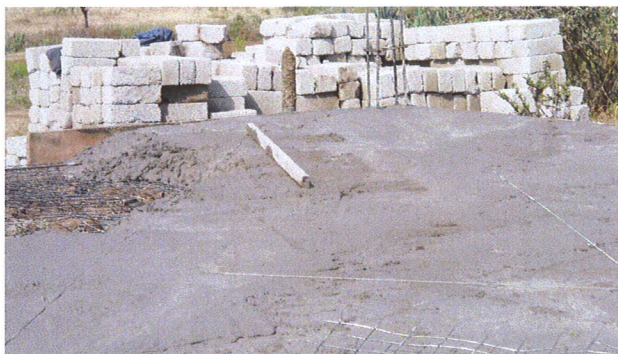
concrete slab – first 2 classrooms