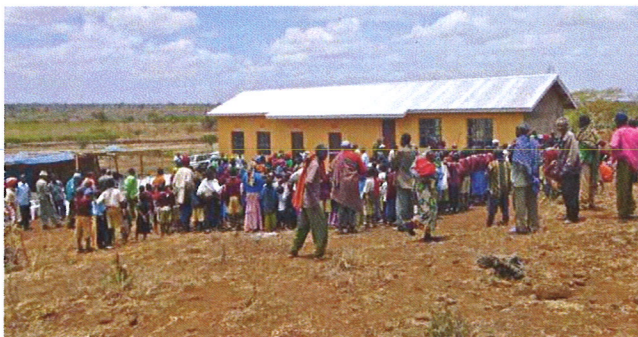
opening ceremonies – first 2 classrooms