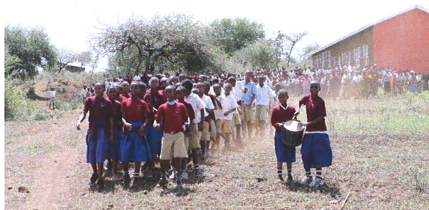
greeting VIP's at school opening