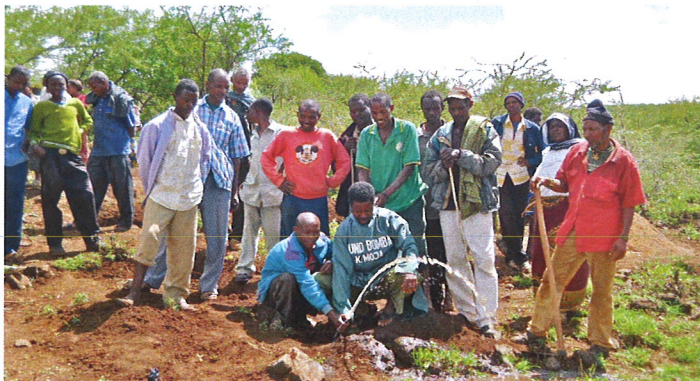
Phase 1 – water supply to site