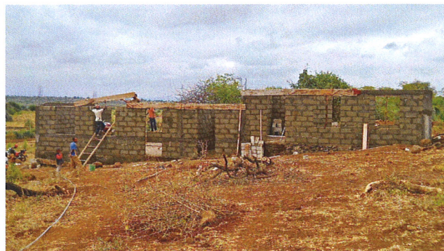
concrete brick walls – first 2 classrooms