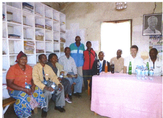
meeting with Kilimamoja Mayor and Council