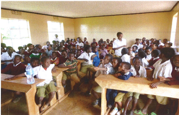
packed classroom – waiting to be fed after ceremonies