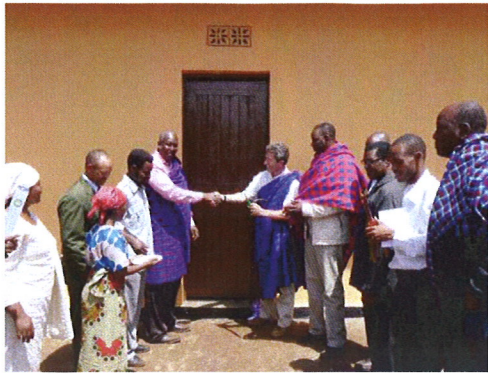
ribbon-cutting – opening ceremonies