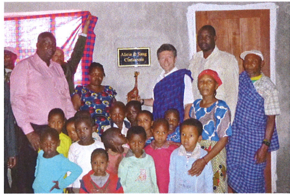
dedication plaque for donor