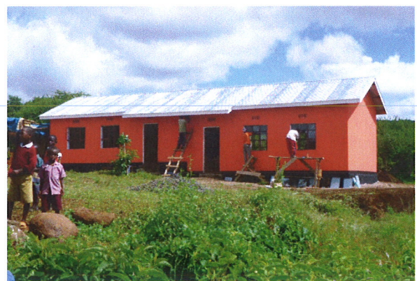
Phase 4 – classrooms 3 and 4