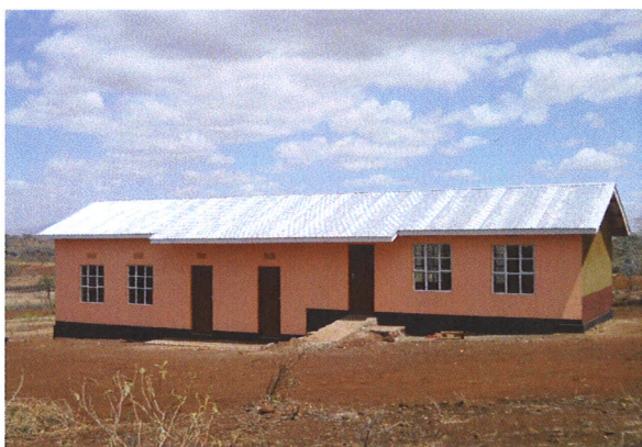
completed first 2 classrooms