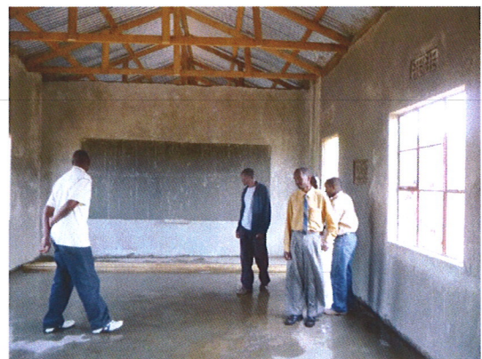
inspecting concrete floor – first 2 classrooms