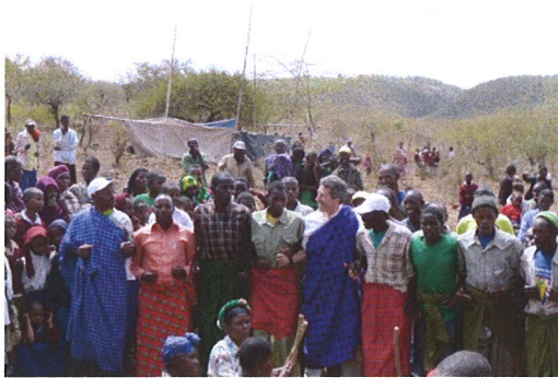
traditional dancing – opening ceremonies