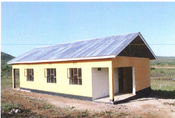
Phase 3 – 2-family teacher residences