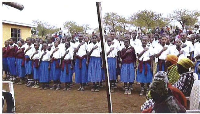
national patriotic song – opening ceremonies