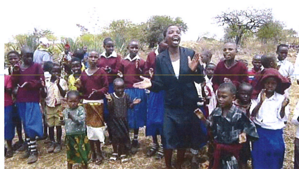
entertainment at opening ceremonies