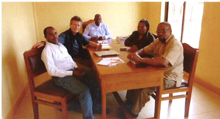
meeting with District Chairman, Education Officers