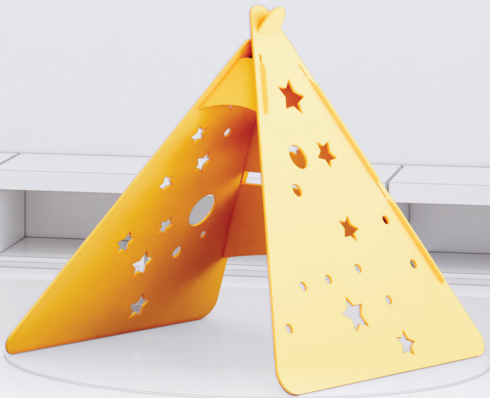
Demco Zen Zone Tent